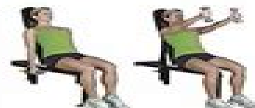
SEATED INCLINE DELTOID RAISE