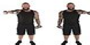
ALTERNATING FRONT DELTOID RAISE