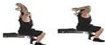
SEATED TRICEPS PRESS