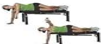
LYING SINGLE ARM FLYES