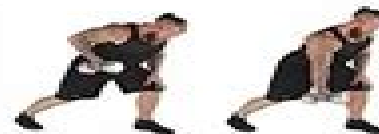
BENT OVER ROW