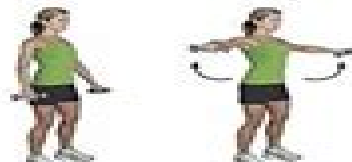
STANDING SIDE RAISE