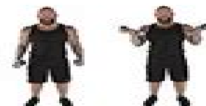
STANDING BICEP CURL